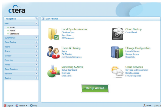
The C200's easy-to-use Web interface